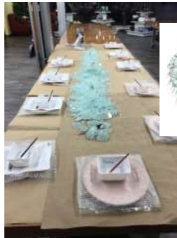
Shatter Glass Plates (one per person)