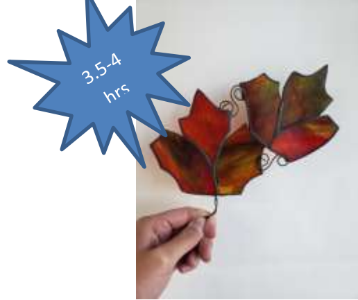
Stained Glass Set of Two Leaves