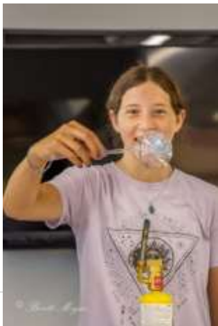
Glass Blowing (three creations per person)