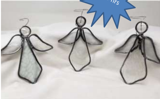
Stained Glass Angel