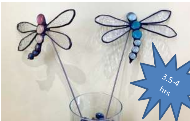
Stained Dragonfly Garden Stake