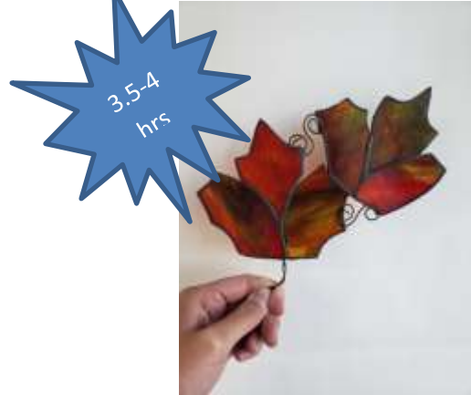
Stained Glass Set of Two Leaves