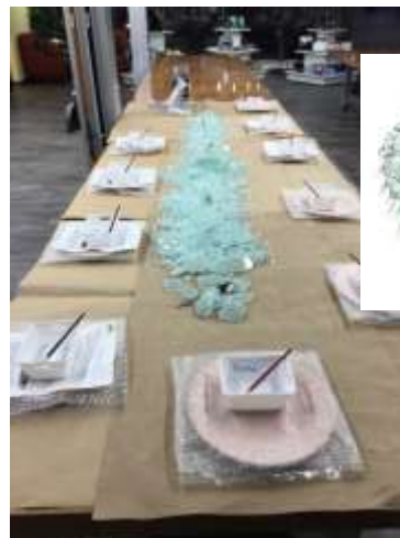
Shatter Glass Plates (one per person)